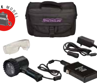
uVision™ 365 AC/DC MOBILE KIT